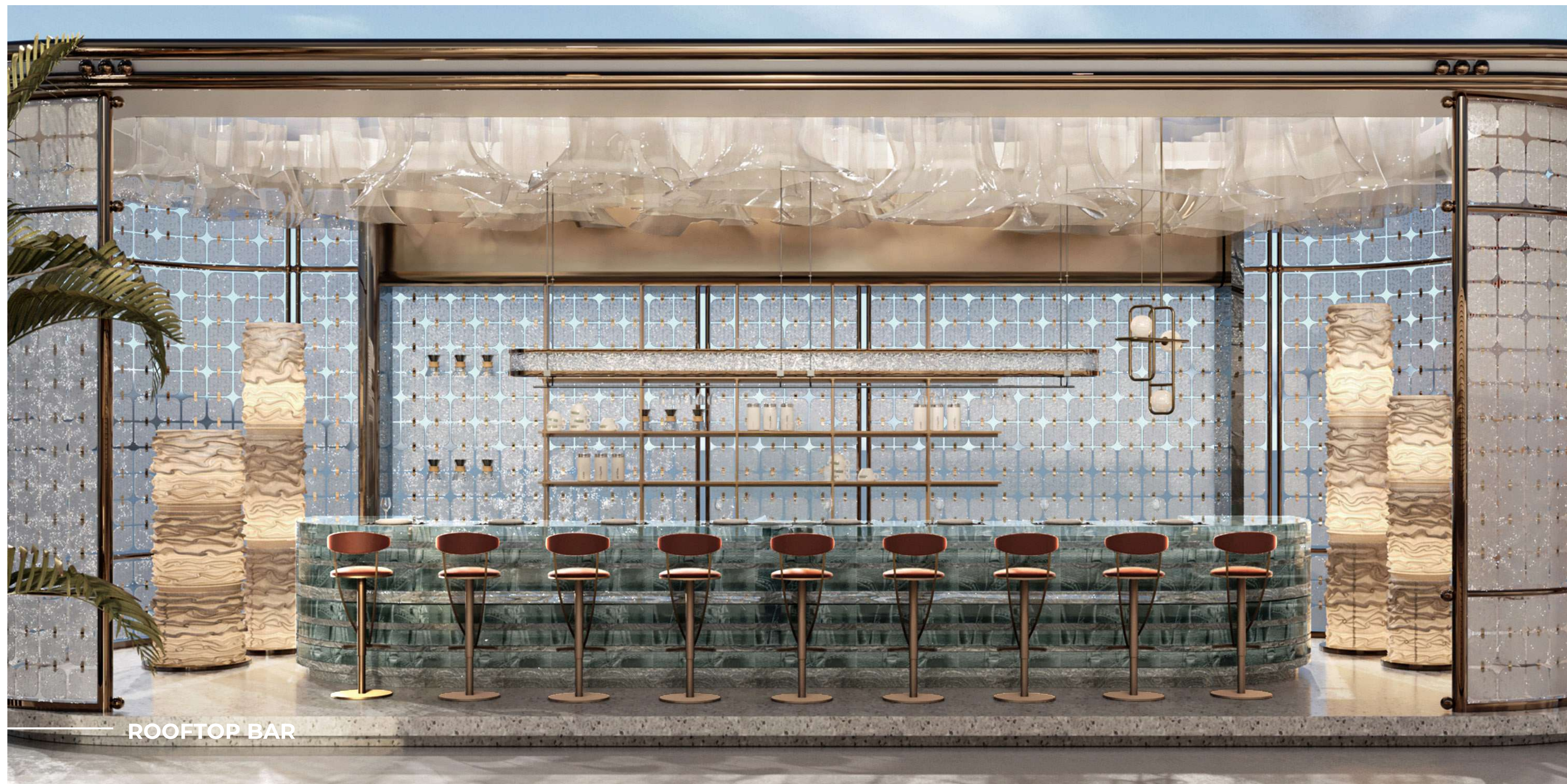
— ROOFTOP BAR