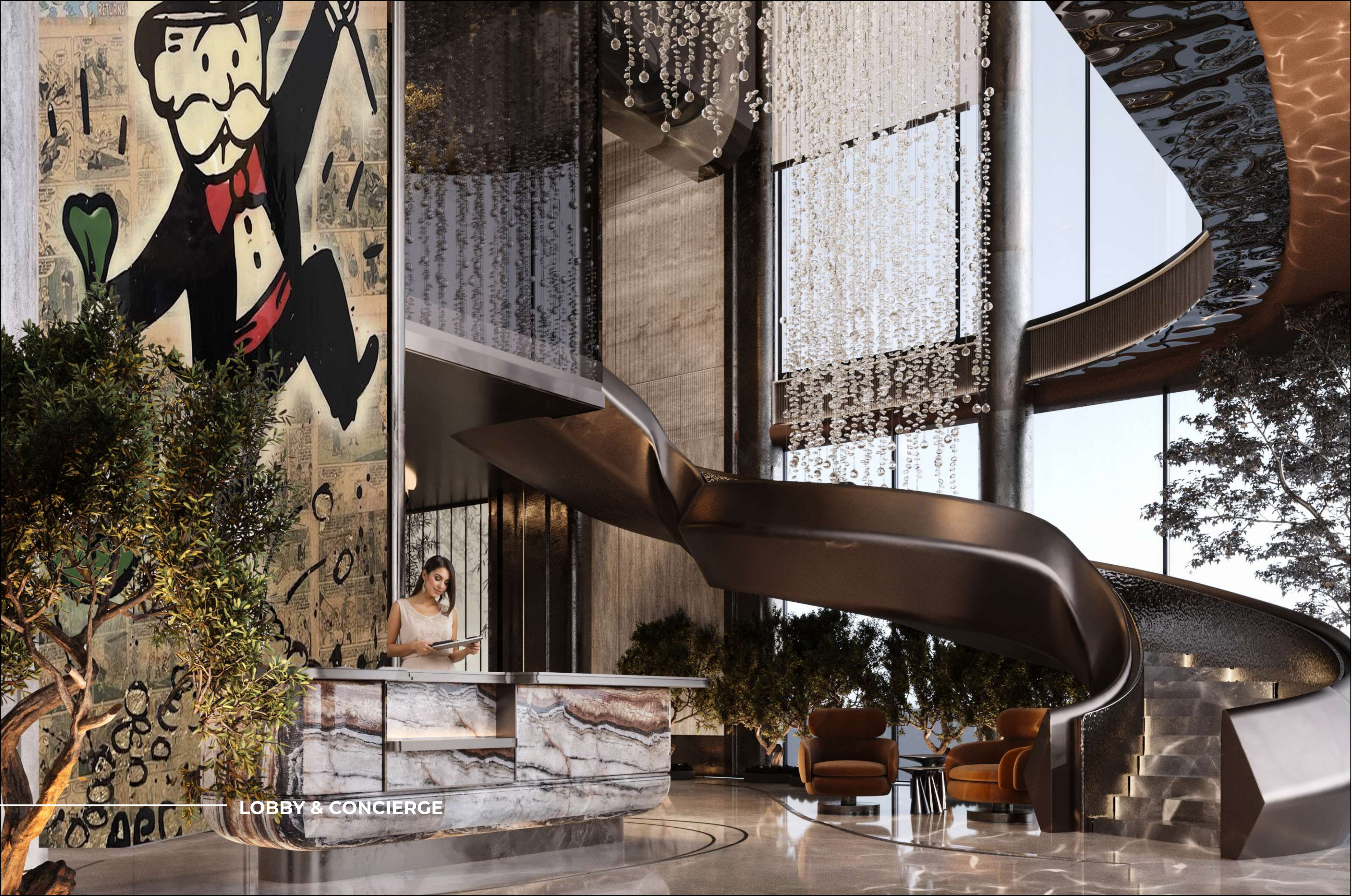
LOBBY & CONCIERGE